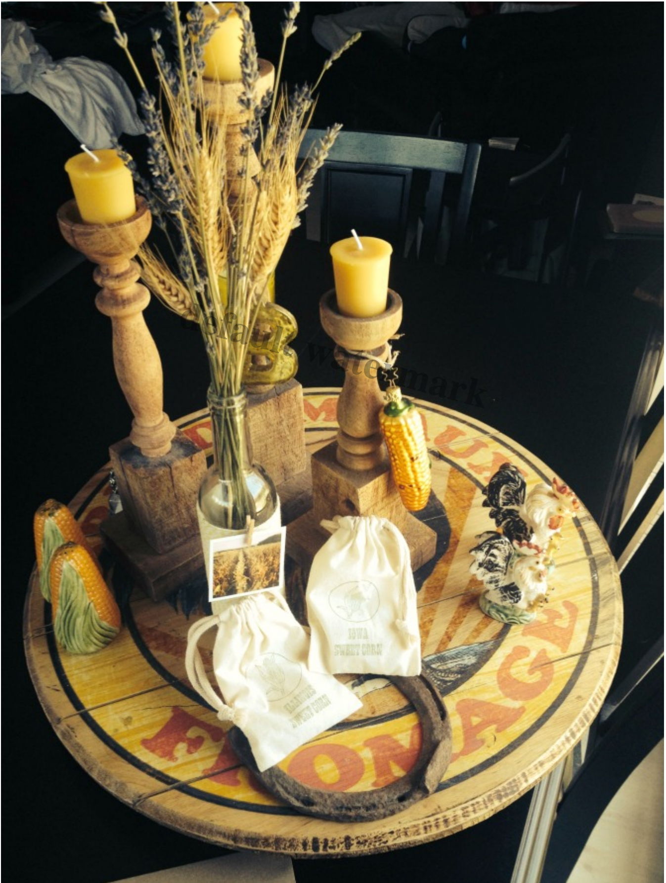
The gift/favor table was adorned w/ farm decor and old family wedding photos attached to bicycle spokes w/ clothespins. The "farm favors" consisted of lavender-lemon lotion bars I made w/