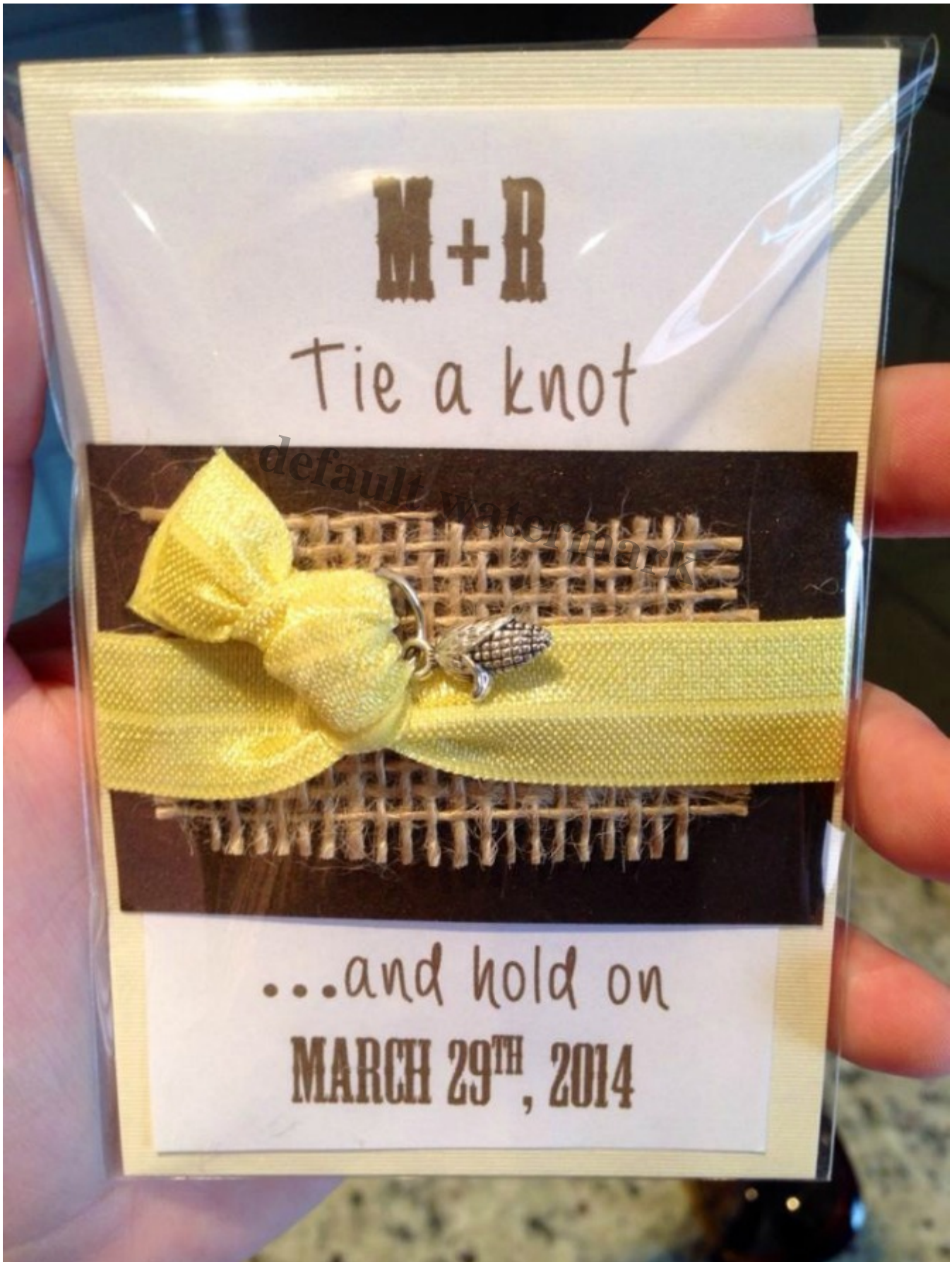
The final favor was created by my good friend Sara Werner ( Sew Creates on Etsy). She made and individually packaged elastic hair ties w/ corn and rooster charms. Card stock that the bands were