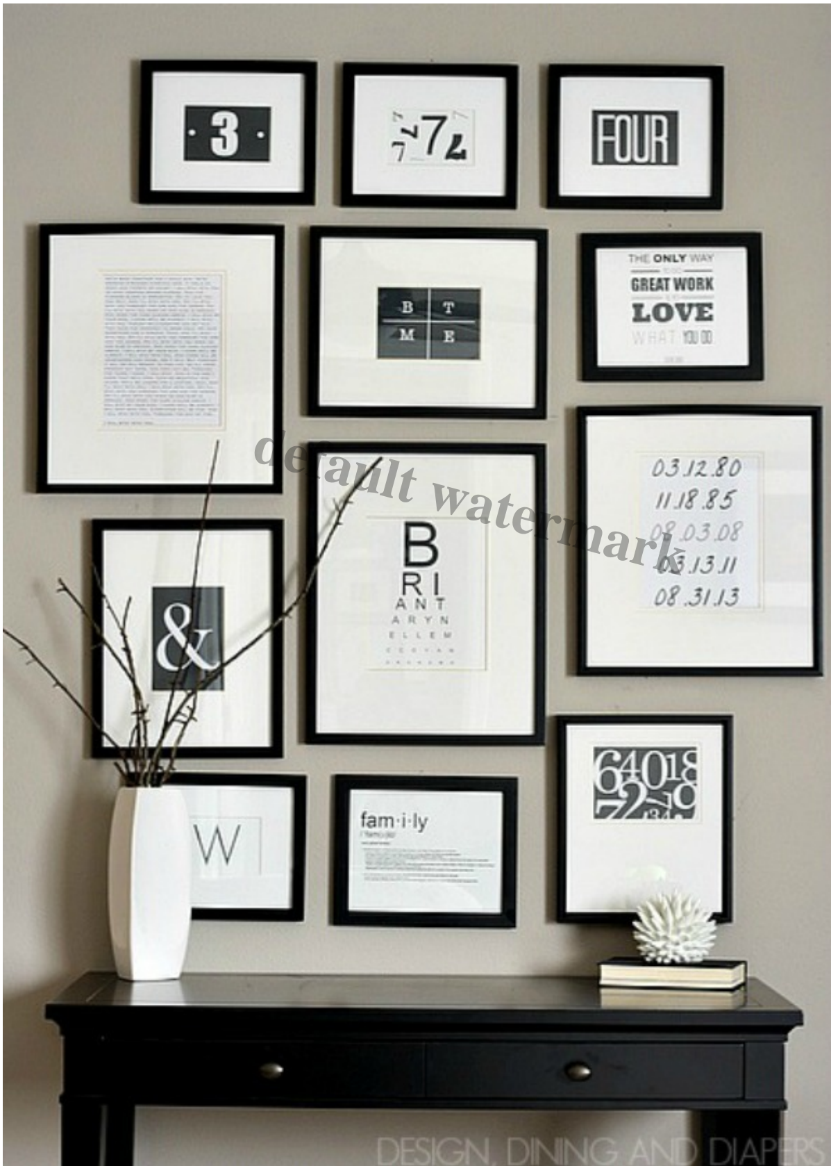
Black and White Gallery Wall