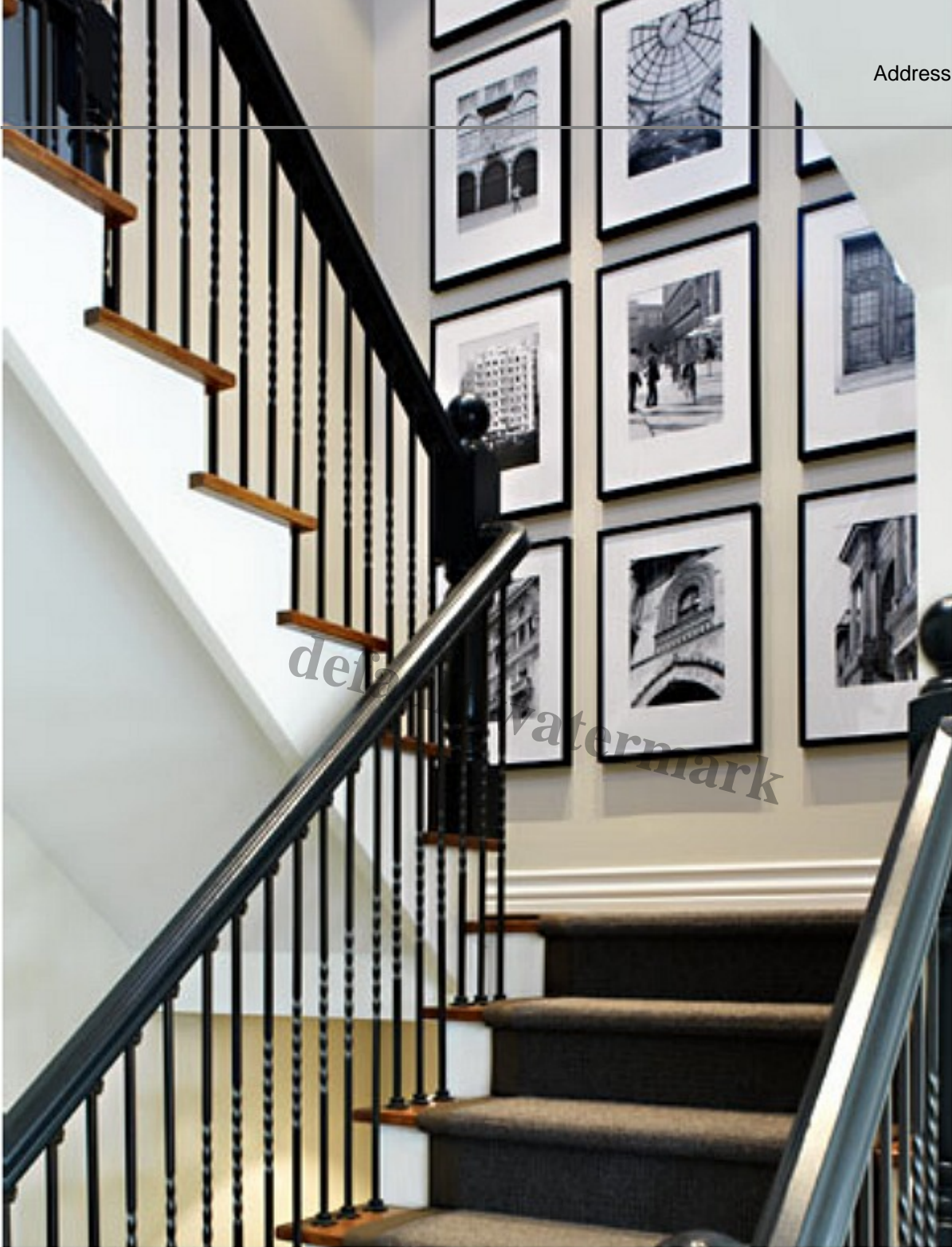
Stairway Landing Gallery Wall