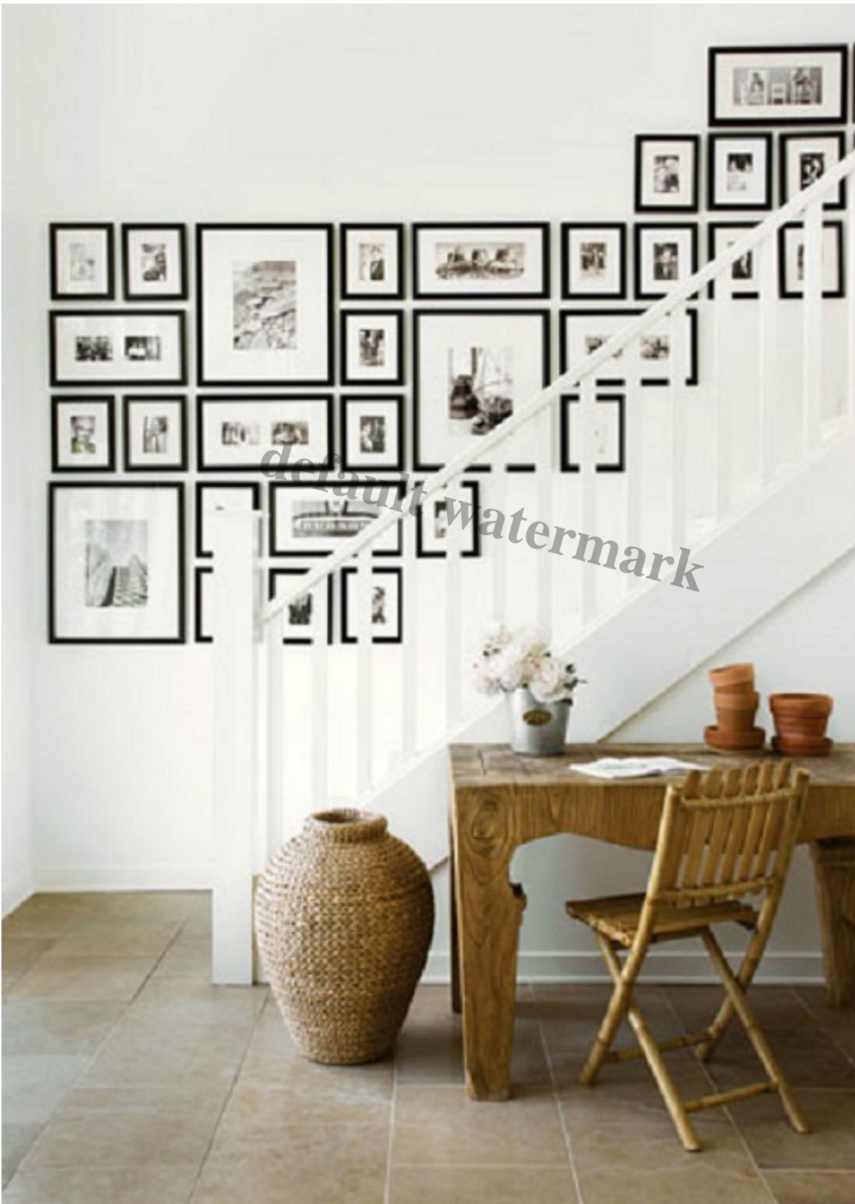
Stairway Wall Gallery

I love how the above gallery wall photos are closely grouped and follow the upward line of the staircase.