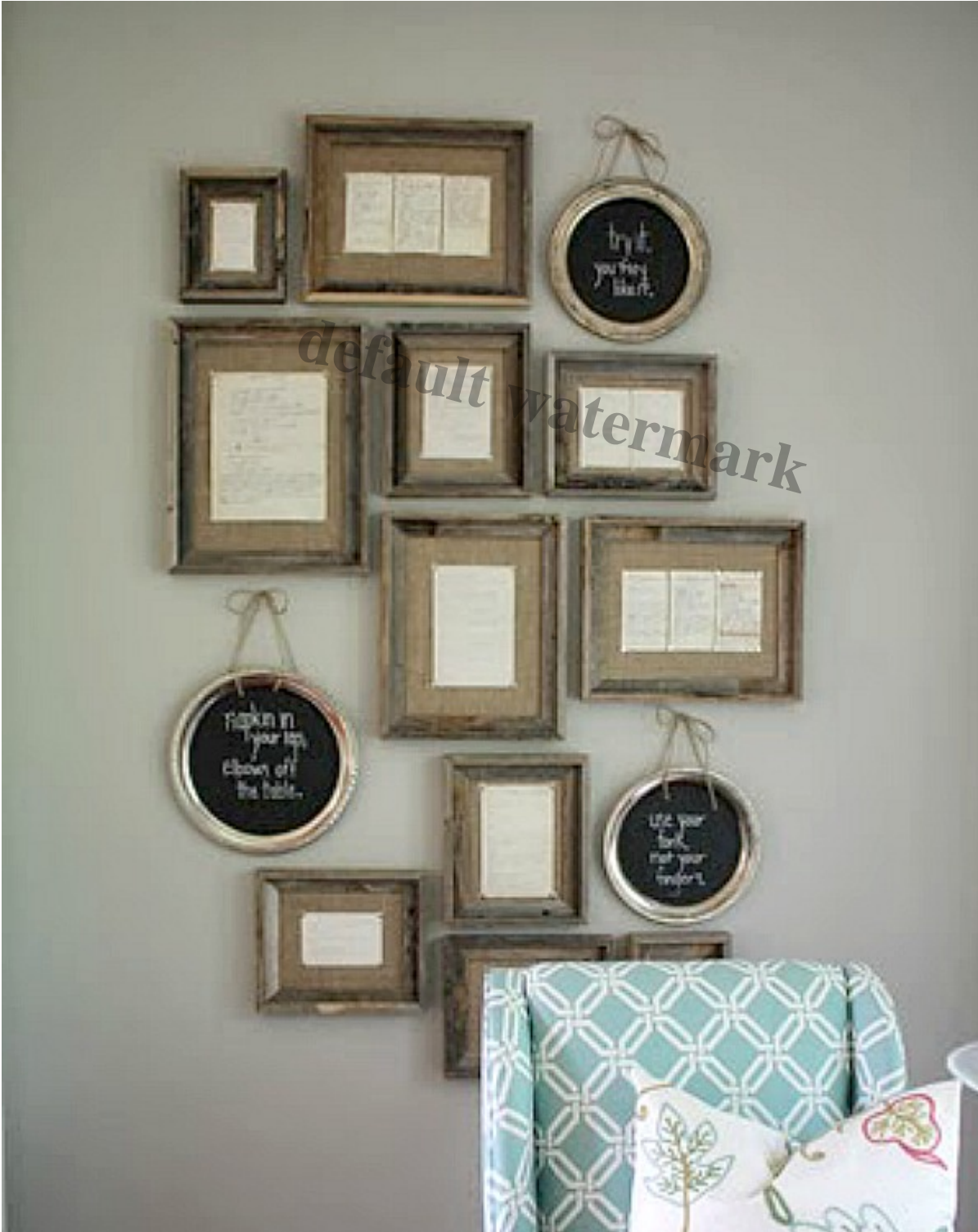
Framed Family Recipes