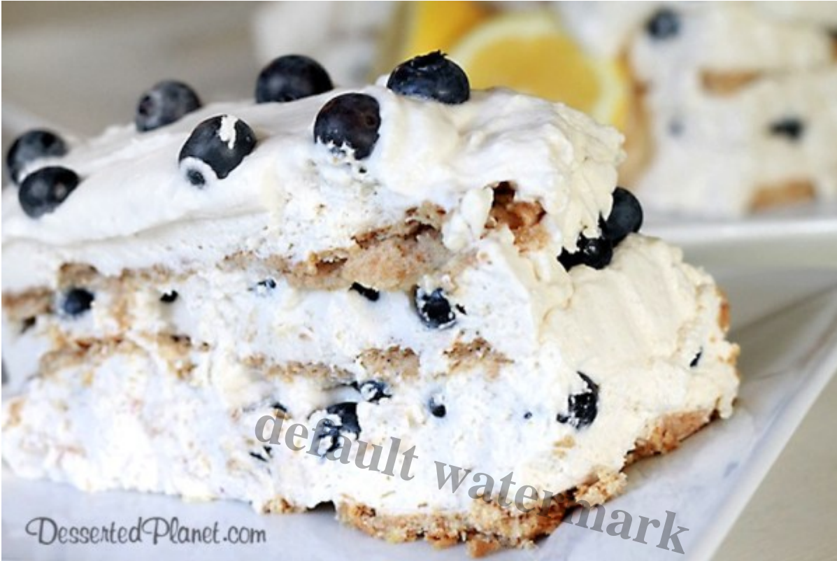
Blueberry Lemon Icebox Cake