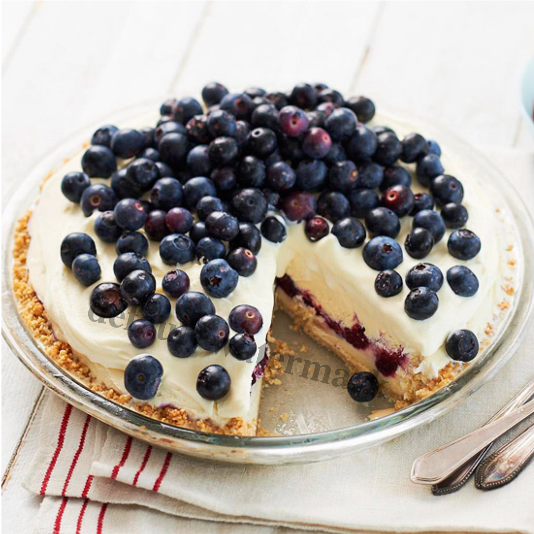
source Better Homes and Gardens Blueberry Ice Cream Pie