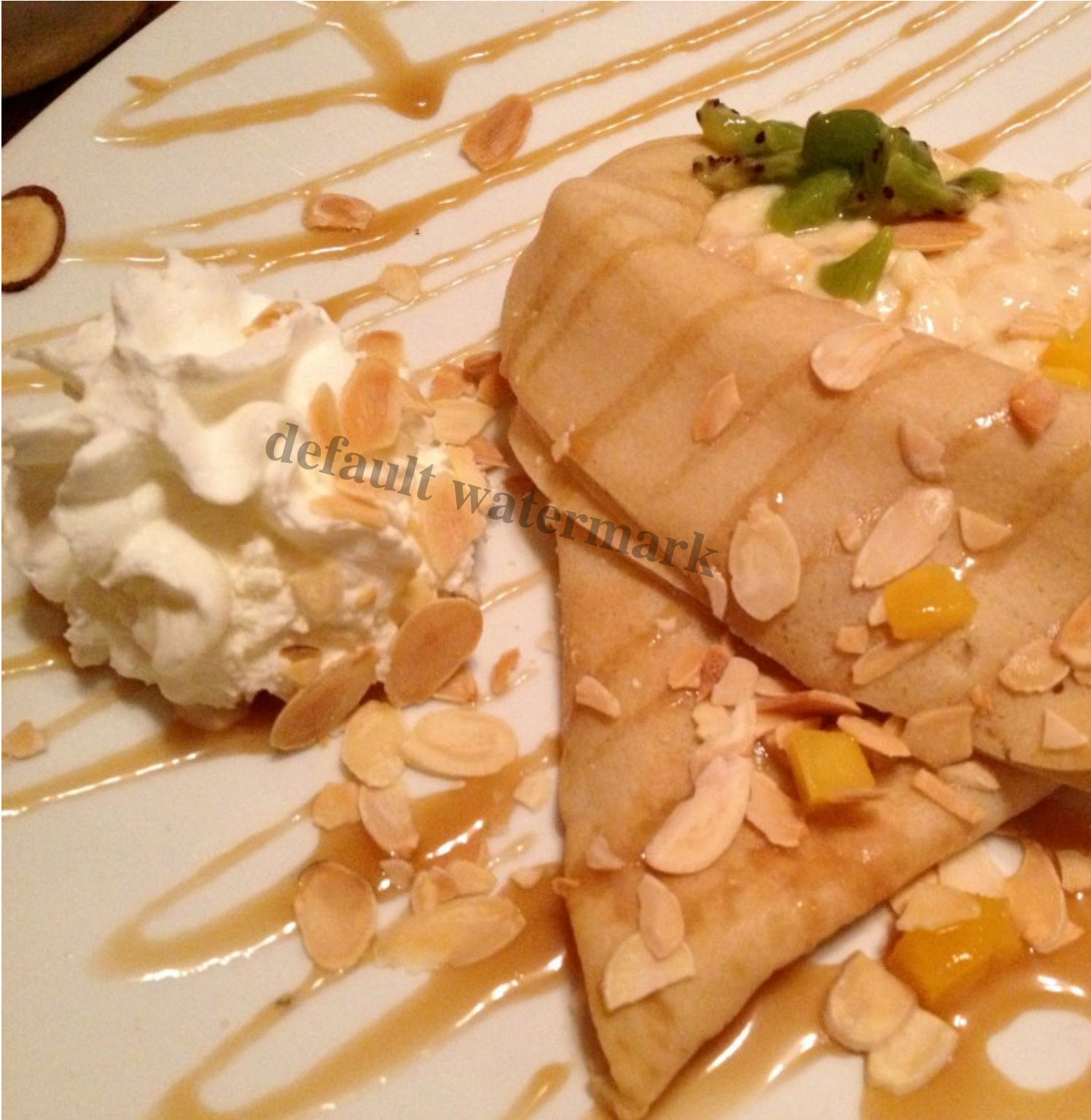
Tropicale Crepe from Chez Elle Creperie